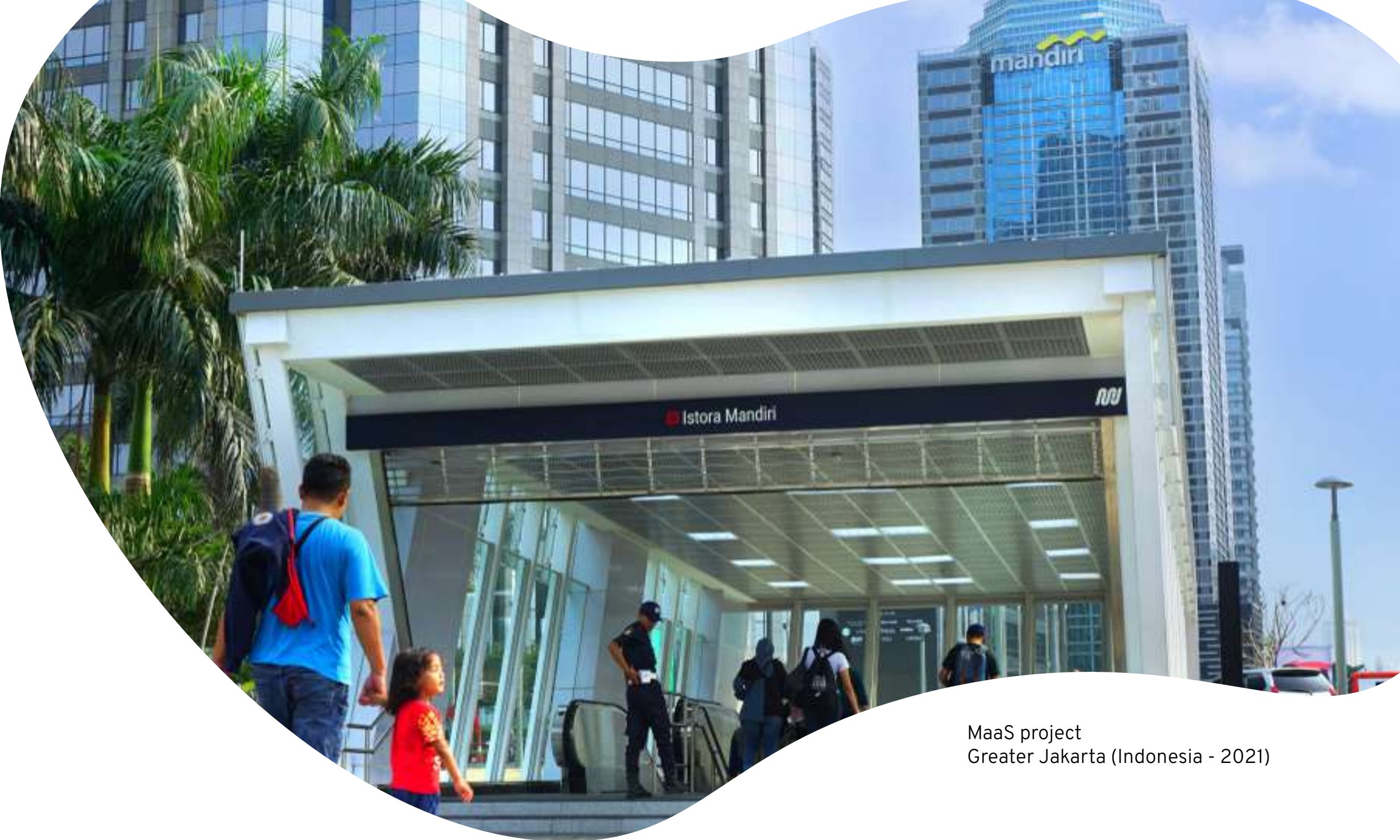
MaaS project Greater Jakarta (Indonesia - 2021)